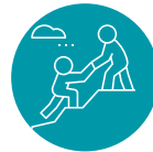
Mentoring and Coaching