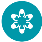
Cross Sector Collaboration