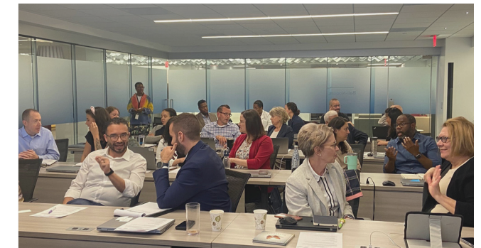
Pictured Above: With support and speakers from the Institute for Higher Education Policy, the Data Quality Campaign and the Texas Higher Education Coordinating Board, L&E led the Foundation's first-ever data retreat in May 2023. Staff from ECMC Foundation and across the ECMC Group enterprise joined a learning session to better understand how postsecondary data can be leveraged to make progress toward systemic change.

As part of our commitment to better our own understanding of trends in the field, the Foundation hosts regular learning sessions. L&E plays an instrumental role in developing these sessions, as was the case during a session focused on higher education data.